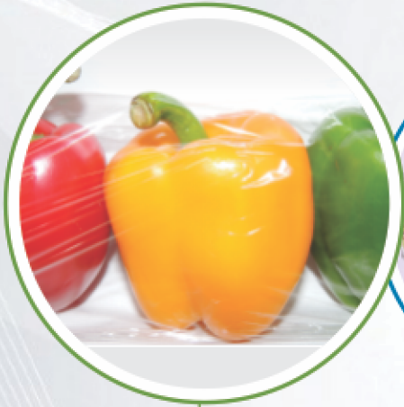
PVC Cling Film