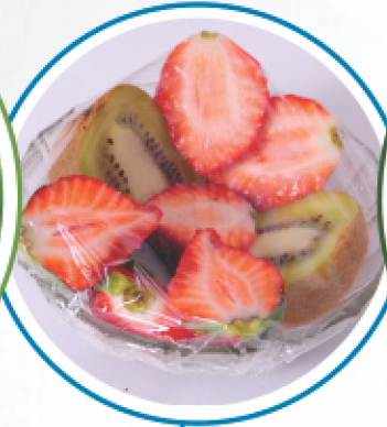
Anti Fog Film